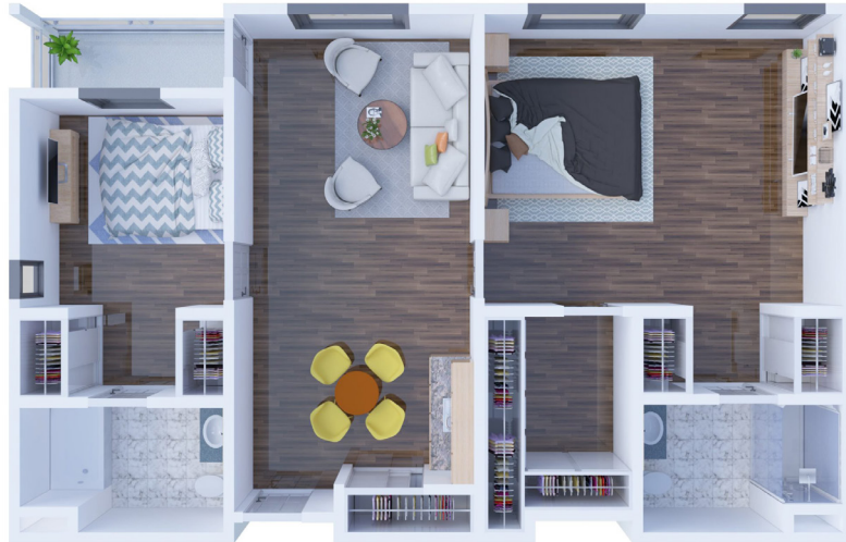
X Two Bedroom 1,066 SQ FT