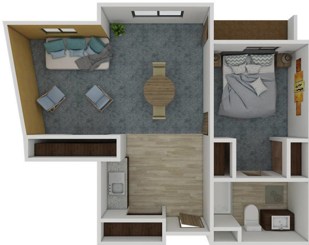
C One Bedroom 742 SQ FT