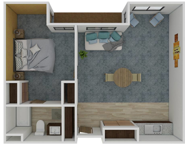
D One Bedroom 871 SQ FT

Solstice Senior Living at Santa Rosa 3585 Round Barn Boulevard, Santa Rosa, CA 95403 (855) 996-9846 SolsticeSeniorLivingSantaRosa.com