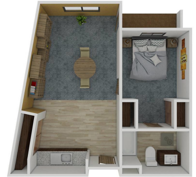
B One Bedroom 663 SQ FT