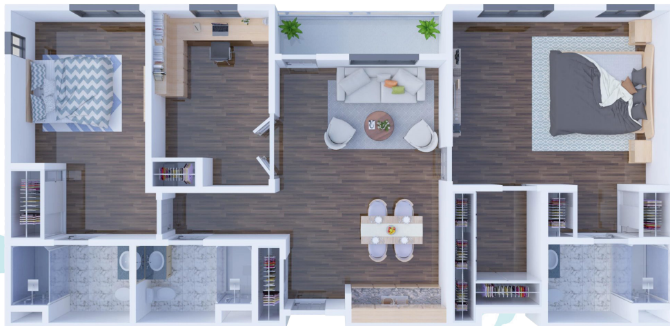
X Two Bedroom / Den 1,404 SQ FT