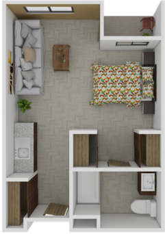
A Studio 477 SQ FT

Solstice Senior Living at Santa Rosa offers several floor plan choices to suit your needs.