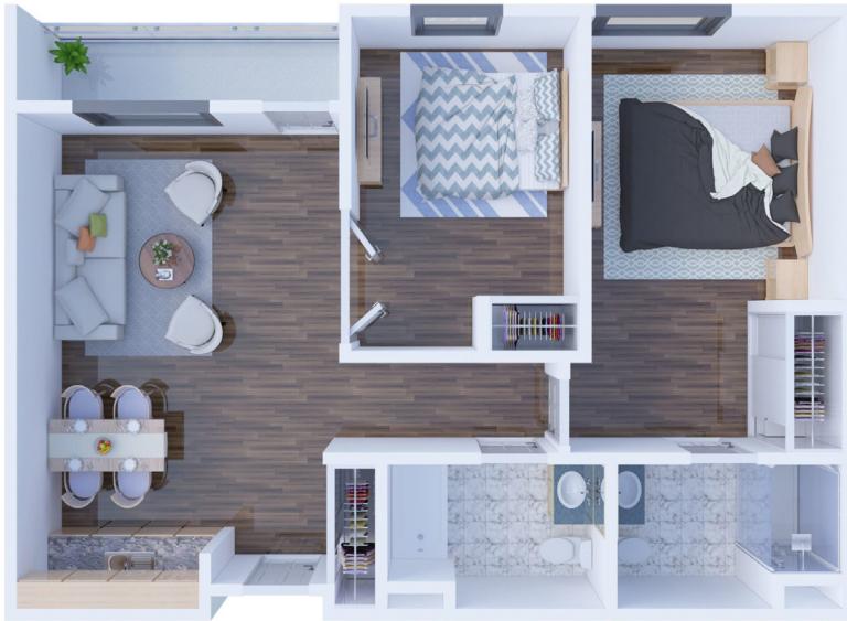
A Two Bedroom 1,036 SQ FT