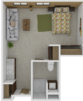
C Studio 497 SQ FT