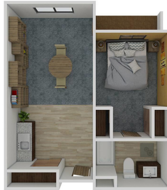
A One Bedroom 598 SQ FT